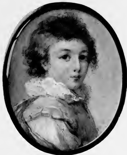
PORTRAIT OF A BOY (NAME UNKNOWN) BY JEAN HONORÉ FRAGONARD